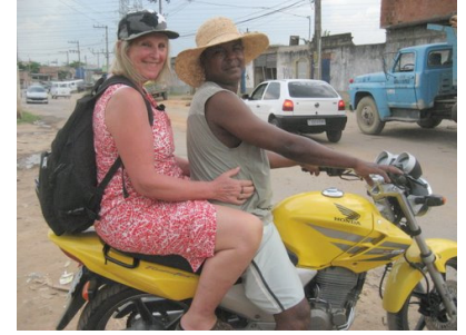
The Terra Encantada Transport Company