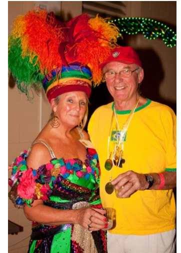
Carmen Miranda Calder & Friend