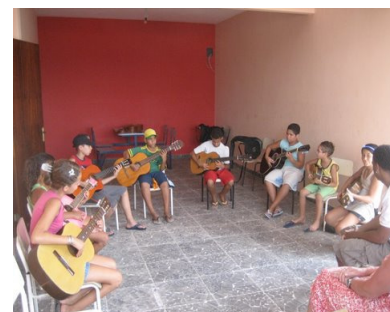
The next generation learns Bossa Nova