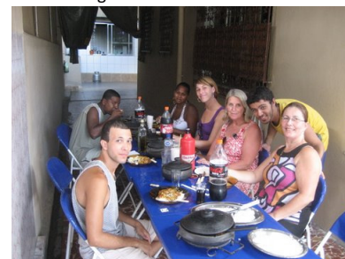
Delicious lunch with friends at Rafael's Mother's seafood shop and restaurant