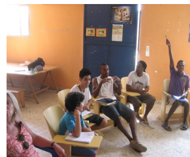
Enthusiastic participation in English class